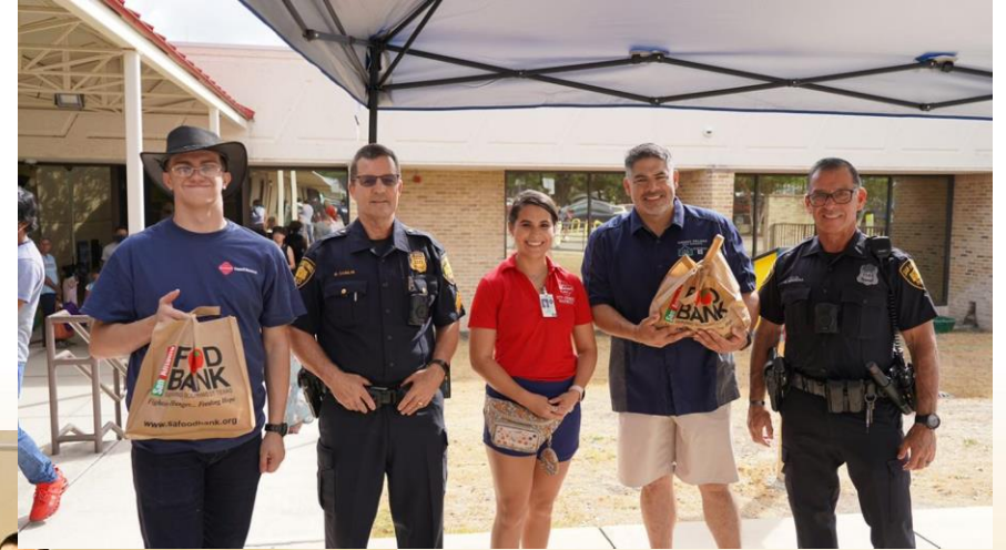
District 8, North Center