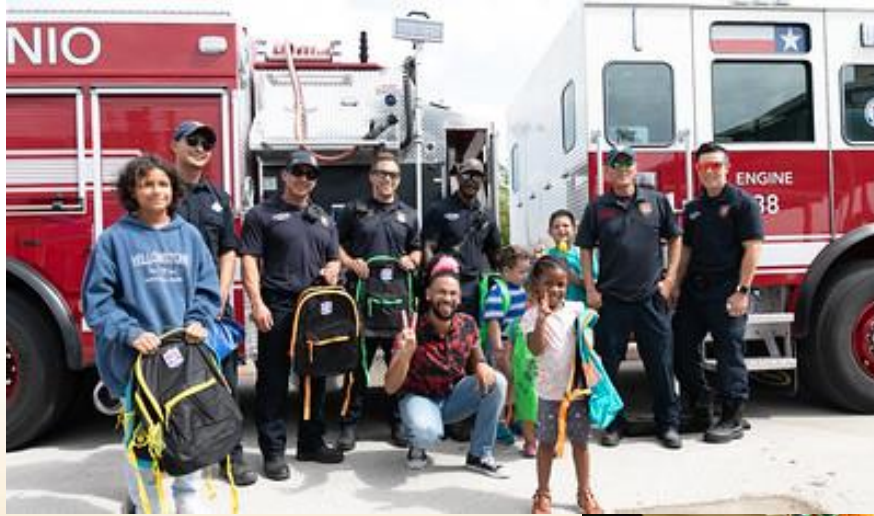
District 2, East Center