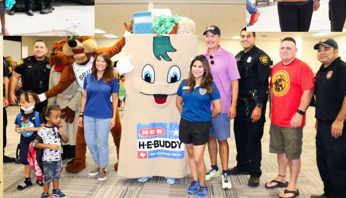
District 6, West Center